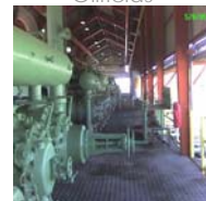
Oilfields Services for PetroCanada