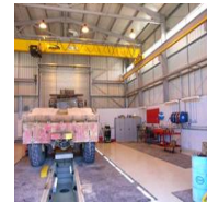
Industrial Buildings at Samah Oilfields for WAHA Oil Company