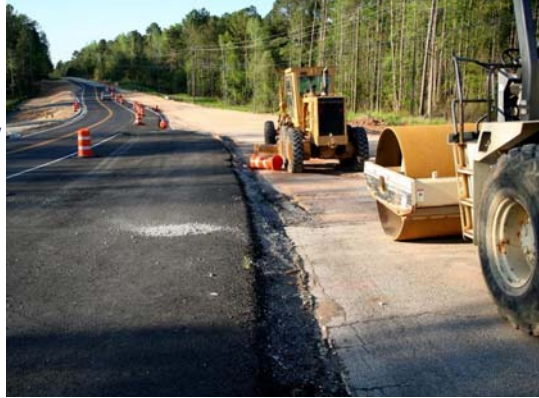
Infrastructure projects since 1991

The commitment to perform with excellence, deliver on time, and meet the established goals reflect in our in-house practices as well as in our reputation earned over a span of 60 years.