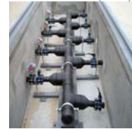
Water tanks and Pipelines and Technical Support Services for Ghani Oilfields