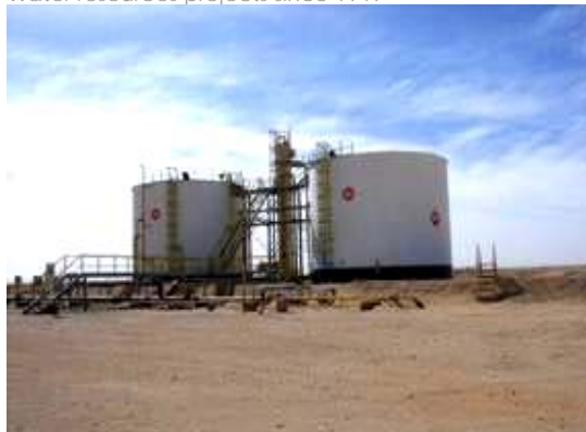
Oilfields services since 1981