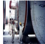
Technical Support services for PCCP fabrication Plant to Al Nahr Company