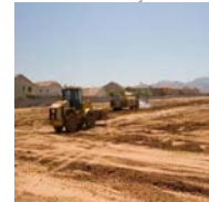
Construction of 2000 homes and infrastructure for HIB in AlKhoms