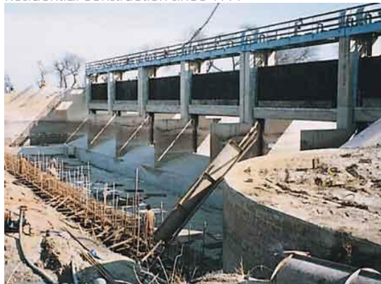
Water resources projects since 1949