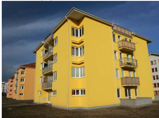
Residential construction since 1991